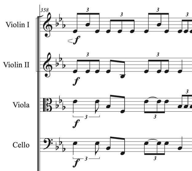
Figure 11: Encouragement motif ("The Fire's Choice").

Calixtos's first aria is full of encouragement generally, and cadences at measure 38 on what my singers have dubbed the "love chord," which is an A-flat add9 chord. This chord reappears in "The Fire's Choice" also, when Elenia tells Calixtos she loves him (Figure 13).