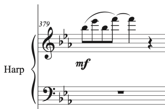
Figure 5: Motif 1: Self-doubt (in “The Fire’s Choice”).