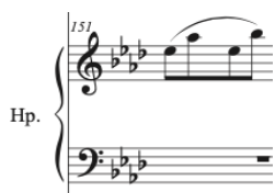
Figure 3: Motif 1: Self-doubt

The listener hears the “self-doubt” motif for the first time at the beginning of her first aria, “If You Need Me,” when Elenia is trying to process her own grief by throwing herself into the care of others and neglecting her own needs (Figure 4). The self-efficacy or self-assuredness motif is heard in the scene right after, when she reunites with Calixtos, whom she loves and has missed terribly (Figure 5). Her self-doubt returns in “The Fire’s Choice,” just after she is chosen as the new queen of the gods, and the second motif returns at the start of her final aria, “I Won’t Forget,” where she sings to Calixtos of her confidence and faith that he is just as “good” as the gods of life (Figures 6-7).