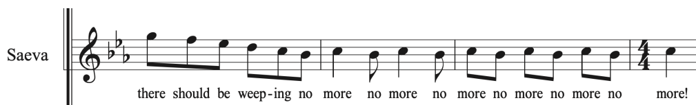
Figure 9: Measure 442-443 Hemiola ("Breathe").

Saeva's spiral into panicky optimism and false positivity by increasing in speed and returning to the initial minor pedal tones. The climactic point occurs when she begins repeating "no more, no more," on quick eighth notes that are, in measure 443, heard in 2 rather than 3 (hemiola) This aids the music in transitioning to 4/4 time as Calixtos begins to sing (Figure 10).