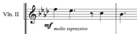
Figure 6: Motif 2: Self-efficacy (in “I Won’t Forget.”)